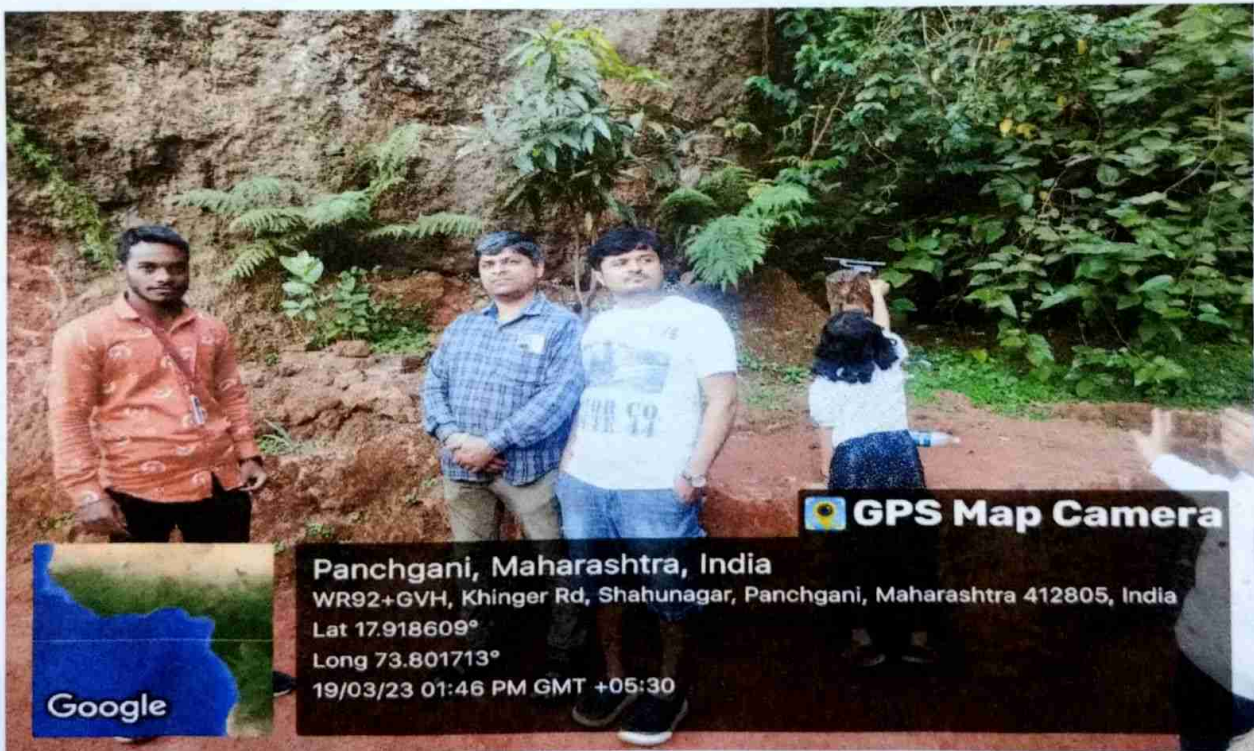
Students of "Certificate Course in Travel Tourism" guiding tourists at Table Land

I/C PRINCIPAL Smt. Meenalben Mehta College, Panchgani (Arts, Commerce & Science) Tal. Mahabaleshwar, Dist. Satara