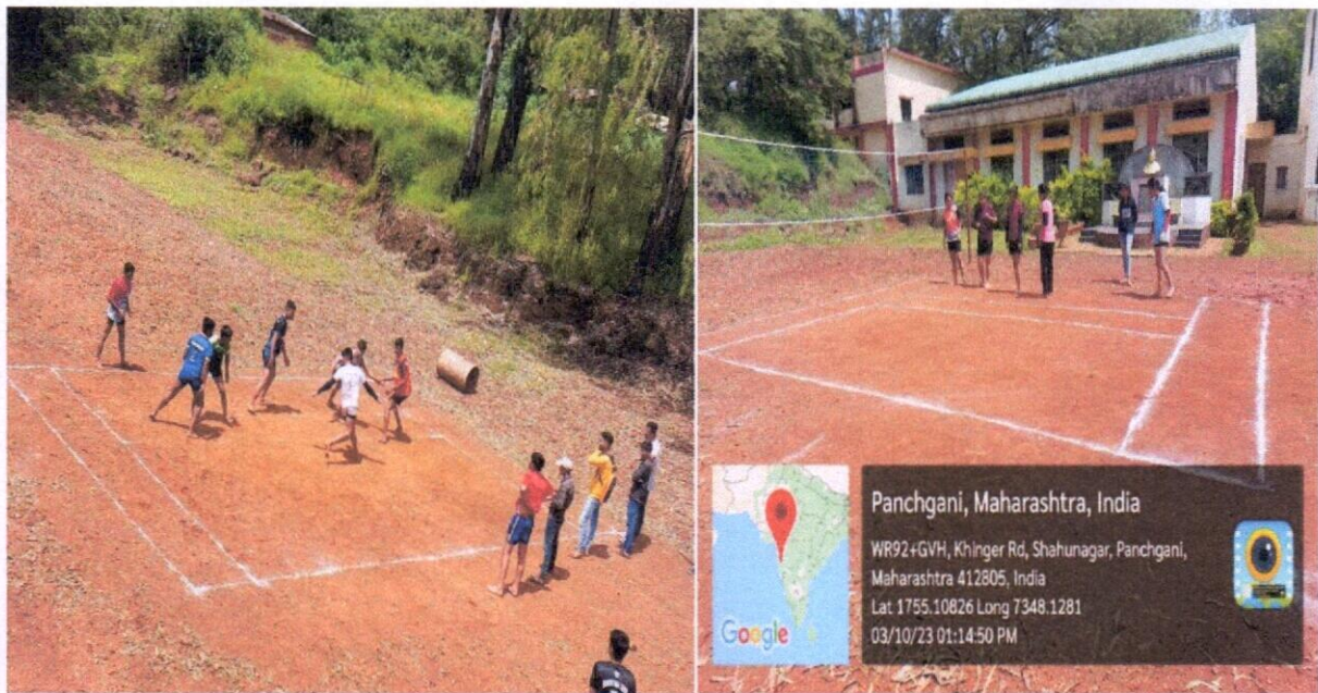
Play ground of Kabaddi, Kho-Kho, Vollyball