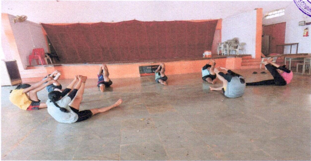
Yoga also Conducted