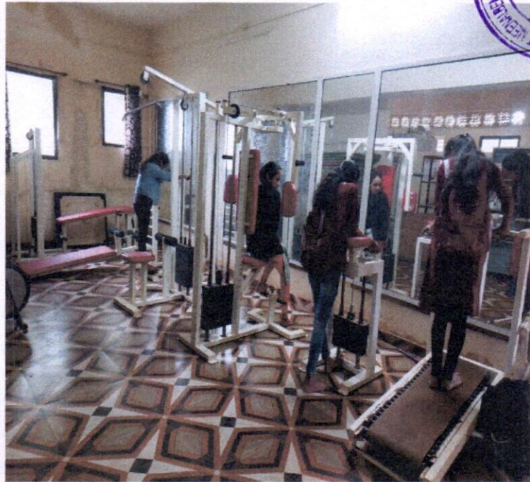
Department of Physical Education & Sports and Gymnasium